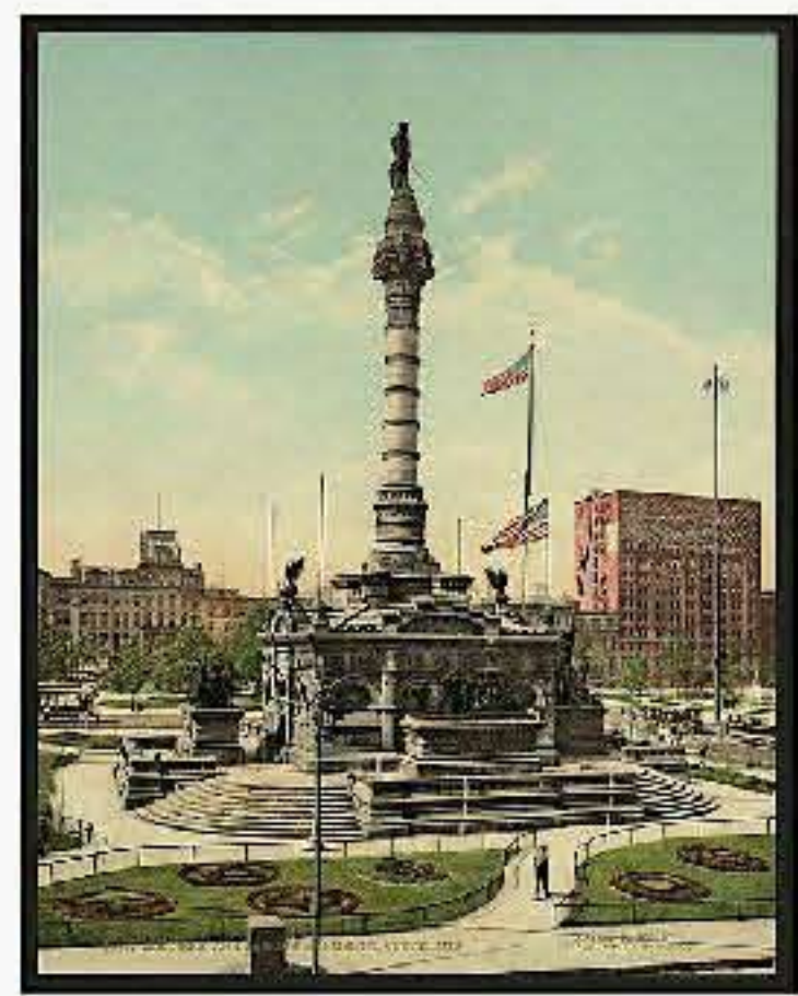
Soldiers and Sailors Mon.