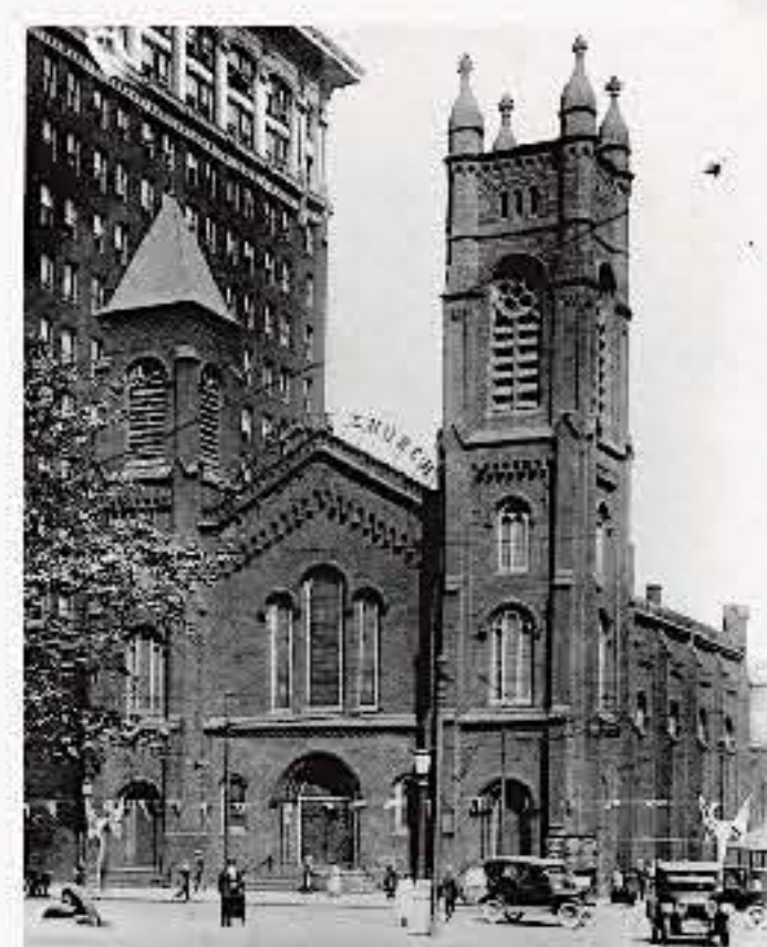
Old Stone Church