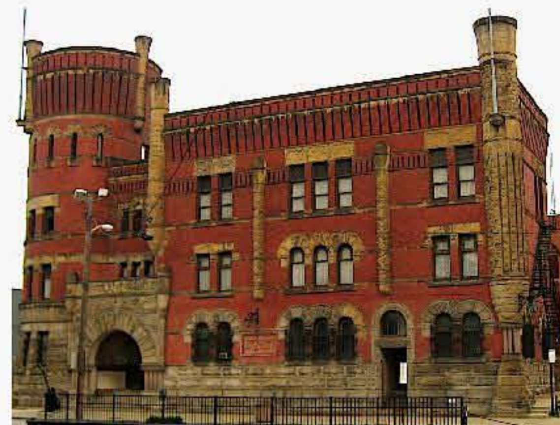
Cleveland Gray's Armory